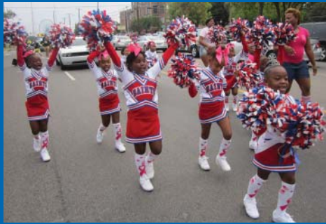
St. Philip's cheerleaders and football players shined at Homecoming